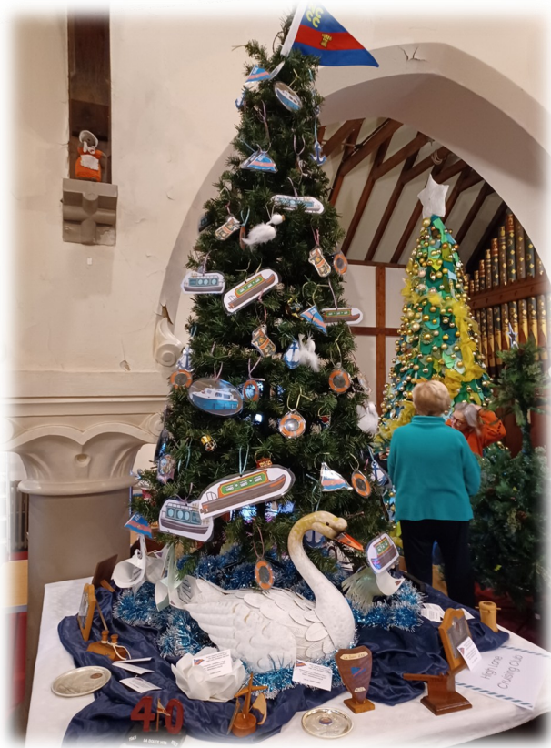
North Cheshire Cruising Club's entry into the '12 Days of Christmas' at St Thomas Church High Lane